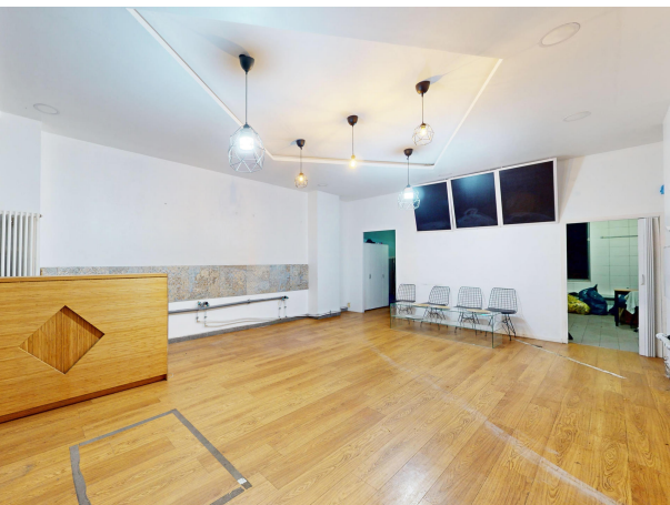
Küche / Aufenthaltsraum