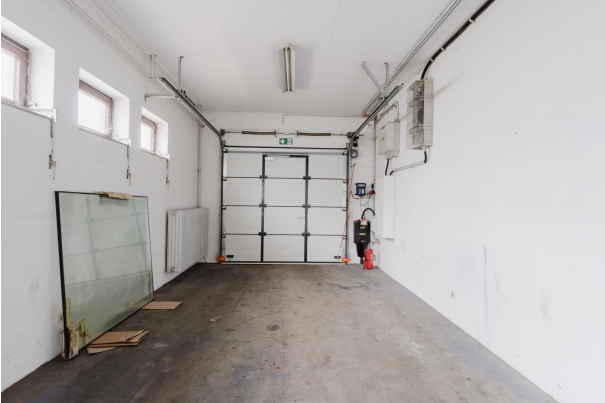
GR Büro OG