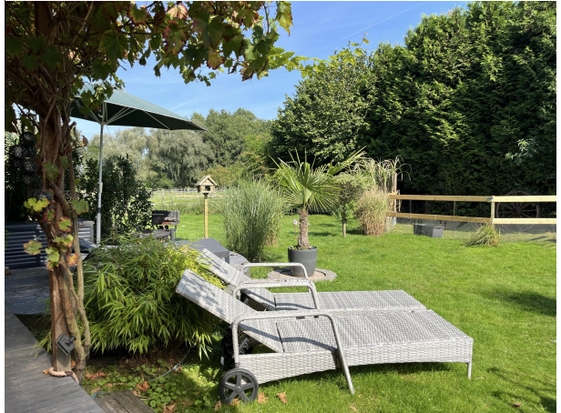
Ruheoase mit Pferden im Garten Wohnung EG rechts