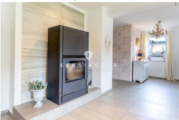
Wohnzimmer Wohnung EG links